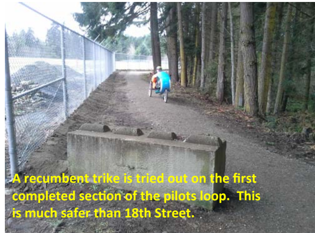
A recumbent trike is tried out on the first completed section of the pilots loop. This is much safer than 18th Street.

However, it takes about ten times that amount or approximately $70,000 to receive enough training to be considered by a commercial airline. Of course times are changing, and the pilot shortage is so critical that more training opportunities might be offered by the airlines. Let’s get our members support on this one. Take the time to mark May 21 st on your calendar.