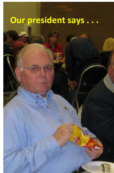
Our president says . . .