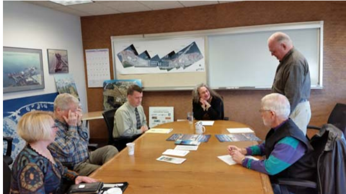
Photo: CCPA board members plan with the Port for the NW Aviation conference and Trade Show in Puyallup. The NWAC&TS will be our February meeting.