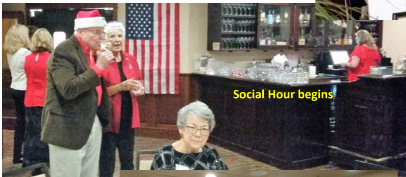
Social Hour begins