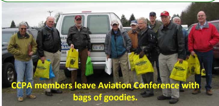
CCPA members leave Aviation Conference with bags of goodies.