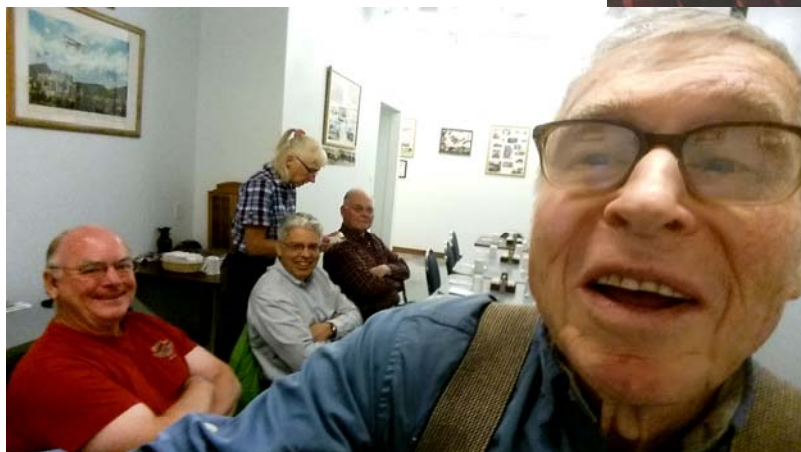
Is it possible to get the photographer’s photo in the picture with the other members of our safety breakfast?