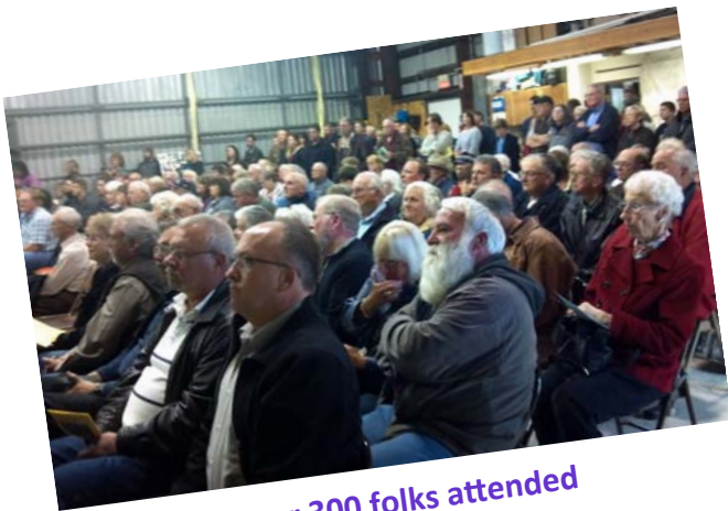
Over 300 folks attended