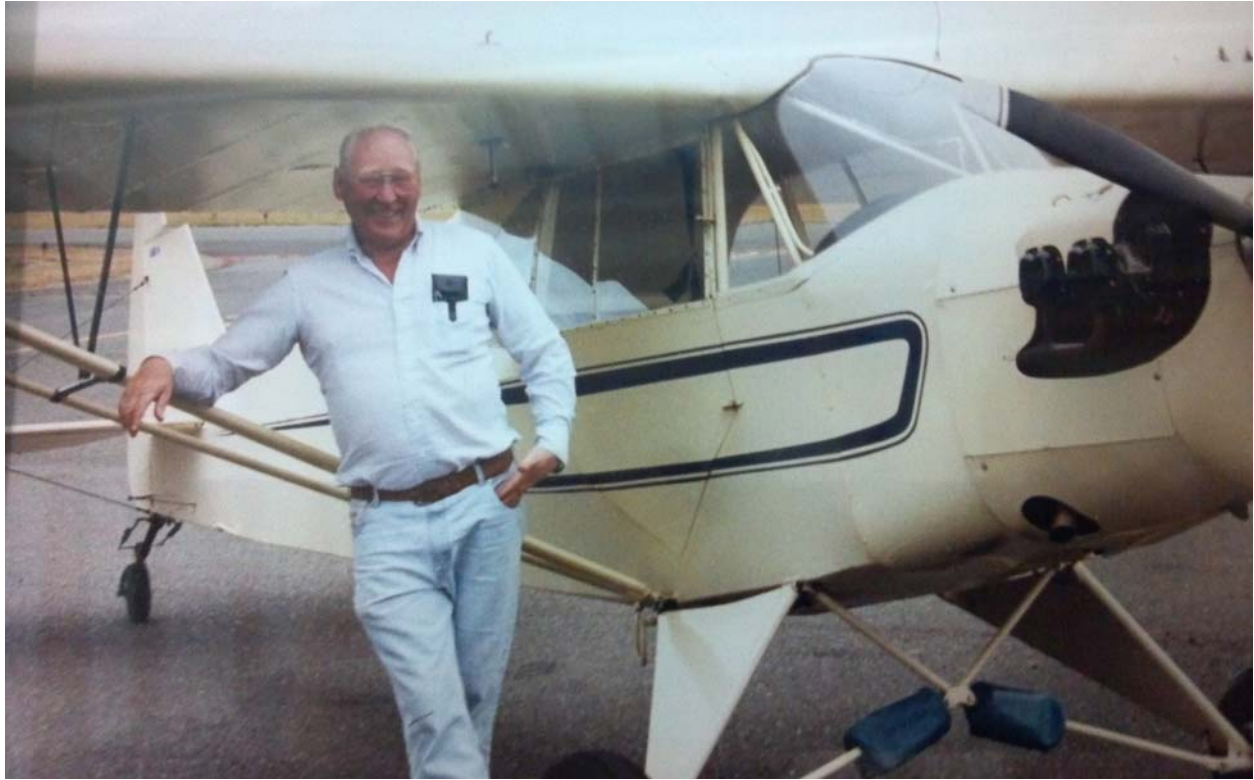
August 7, 1933—October 15, 2011