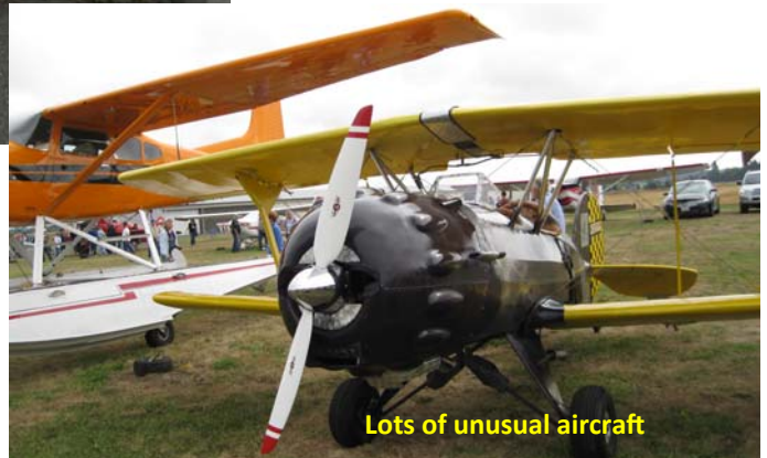
Lots of unusual aircraft