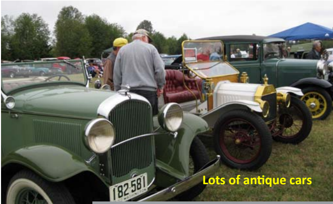
Lots of antique cars

If you showed up at Sequim Valley Airport on August 31 or September 1, you would have been impressed with the number of exhibits and people who turned out. It was a very busy airport on those two days.