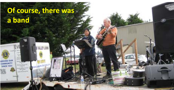
Of course, there was a band