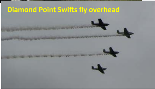
Diamond Point Swifts fly overhead