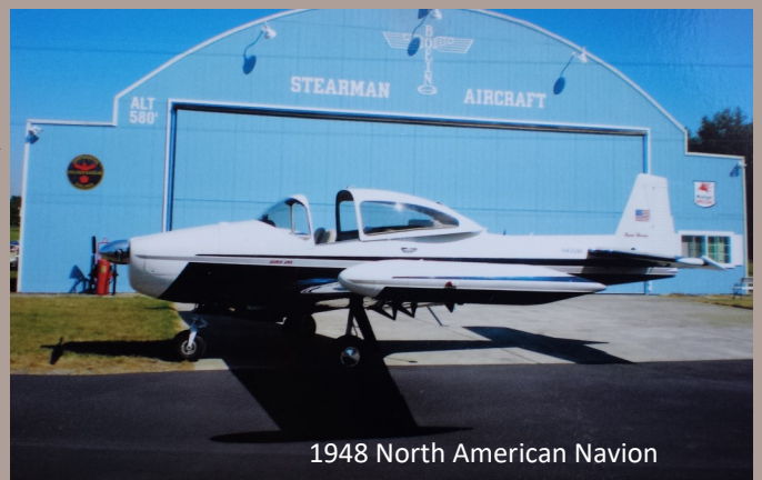
1948 North American Navion

Mugu, CA. VP flying the P-3 at NAS Moffett, CA. VP maintenance officer SRU VP-69 at Point Mugu, CA. CO MB NAS Cubi Point, Philippines. Staff-AIR operations officer coastal defense command, at NS Jacksonville, FL. I was hired by Continental Airlines in April of 1968 and worked my way to Senior Flight Instructor Captain on the B-777. Ratings ATP Airplane Multi-Engine Land 727, 737, 747, 757, 767, 777, DC-9, DC-10, L188, LR Jet, and Commercial Privileges in Airplane single engine land and rotor craft helicopter. During Continental strike from 1985-87, I worked for Boeing as a flight instructor before returning to Continental to finish my career.