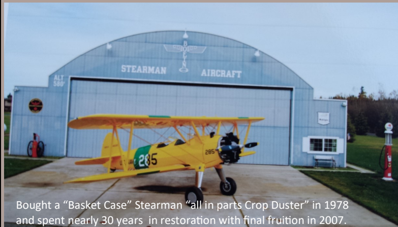
Bought a "Basket Case" Stearman "all in parts Crop Duster" in 1978 and spent nearly 30 years in restoration with final fruition in 2007.

While there, I flew an A-4 at Nas Los Alamitos, California, F-8 & F-4 at Nas Miramar, California., NARU training officer flying a C1A at Nas Point Mugu, California. College flight recruiting in a T-34 in Point