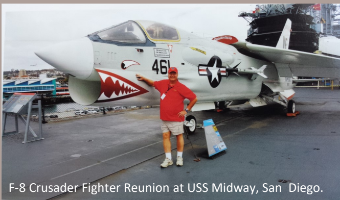
F-8 Crusader Fighter Reunion at USS Midway, San Diego.