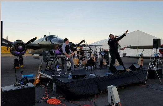
After-Party U2 Tribute Band