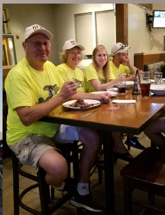
Poschwatta Family Volunteers