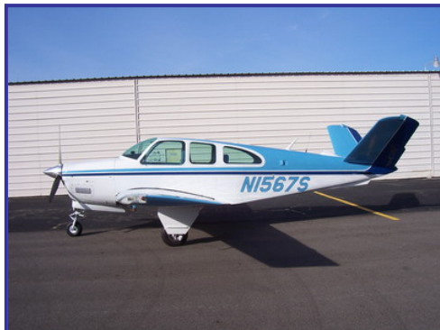
1957 BONANZA H35

24-hour Service Call (360) 733-3174 main (877) 770-1070 toll free (360) 527-9451 fax