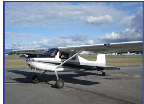
CESSNA 150 TEXAS TAILDRAGGER

Available for tailwheel training beginning in April. $105/HR.