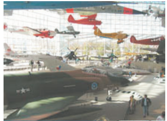
The Great Hall of the Museum of Flight, Boeing Field