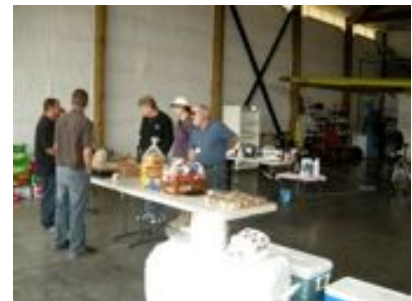
Lunch spot for crew and support personnel.

Part of our NS WPA chapter dues went to support this activity in support of aviation at BLI. I am looking forward to activities such as this in the future.