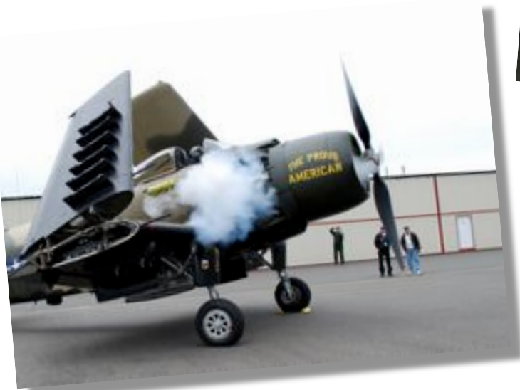
Lots of smoke erupts as the A-1 starts. As it taxis out the wings lower to flight position.