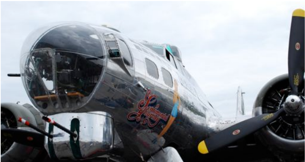
The star—the Commemorative Air Force's Sentimental Journey

On the weekend on August 15-16 NSWPA was able to supply lunch to the numerous personnel that made the visit of the B-17G Sentimental Journey possible. During Saturday and Sunday the NSWPA had lunch available for the air and ground crew of Sentimental Journey along with the personnel of the Heritage Flight Museum and the Civil Air Patrol cadets that provided local security.