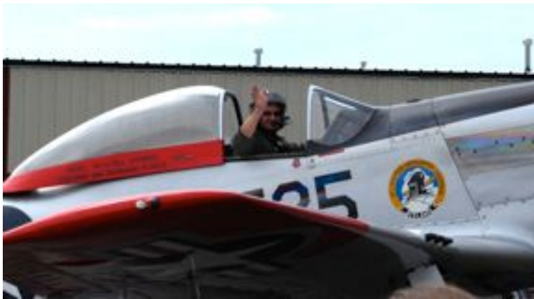
A wave to the crowd as the P-51D goes out for another flight.