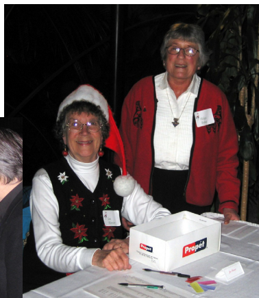
Guests were greeted