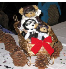
Toys were donated for Toys for Tots

Link for more photos http://tinyurl.com/3adn6m