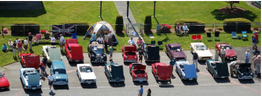
Tyee Sport Club 17 cars plus a few others that just had to join them