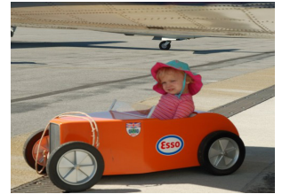
88 degrees staying cool in the shade