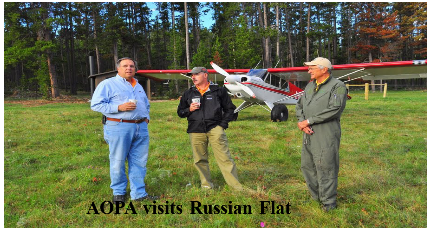
AOPA visits Russian Flat