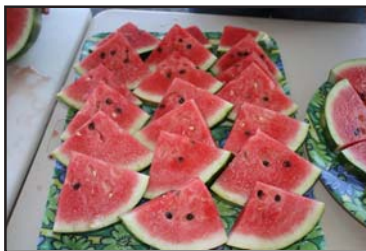
Feel free to join in and bring a side dish.