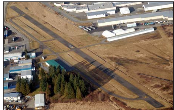
Closed runways at Blaine Municipal Airport

So, how can we in the GA community have more clout on the issues important to us? It boils down to time and money. If you and others will volunteer time in Olympia to work on the ethanol problem that's a big help. But few of us can afford to spend day after day working with legislators so they understand the risks they've created for accidents, the damage to our equipment, and the real costs of injecting ethanol into fuel or allowing wind mills to site next to an airport. We need funds to hire a lobbyist. At election time we need to support GA friendly legislators. Money is what the oil companies have to hire a lobbyist to testify and talk with legislators.