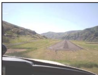
On final approach to Lower Granite airport (00W)

Mark your calendars for Saturday, May 23rd for our annual Lower Granite airport work party. Fly in or drive in as we fix up the trail, check the runway and do a little maintenance to our adopted airport. Bring a rake, shovel, weed-eater or just a pair of gloves. Contact Tom Morris for details.