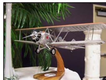
Even the Boeing 40 attended!