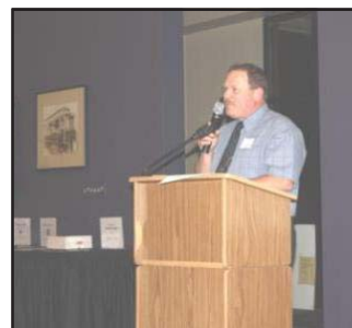
WPA/Spokane Chapter President addresses the group.

Over 130 people attended the Spokane Chapter annual banquet and auction, raising over $4000 for the aviation scholarship fund.