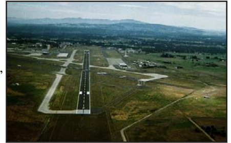
Runway 7/25 is now the main runway for a few weeks.

Spokane International Airport (GEG) announced that, as of 6:00 a.m. PDT, Tuesday, September 7 th , aircraft take-offs and landings have shifted to the alternate east/west runway, 7/25, which is 8,199 feet in length.