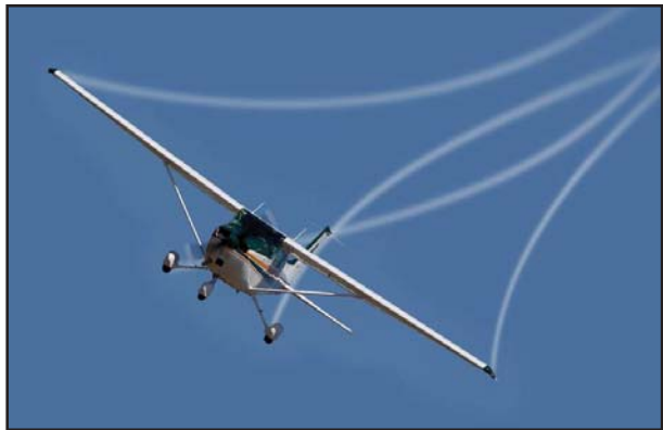
And, who says jet jockey's have all the fun. Even Cessna's can push the envelope and generate some vapor trails.