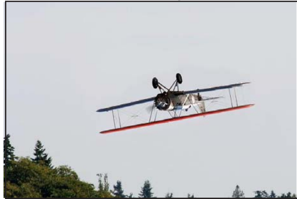
Just like the famous Boeing 707 demo flight over Lake Washington, all Boeing airliners should be able to fly inverted. Here's the Seattle factory's first passenger craft, the Boeing 40C, showing how it is done.