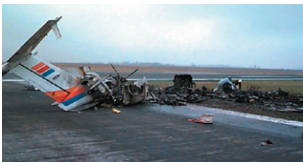
Remains of the Beech 1900C after the collision and ensuing fire.

The NTSB determined that the probable cause of the accident was the failure of the pilots of the King Air “to effectively monitor the CTAF or to properly scan for traffic...”