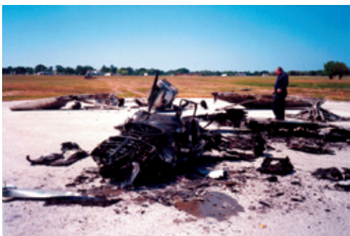
Remains of the Cessna 152 and Cessna 172 after the accident.